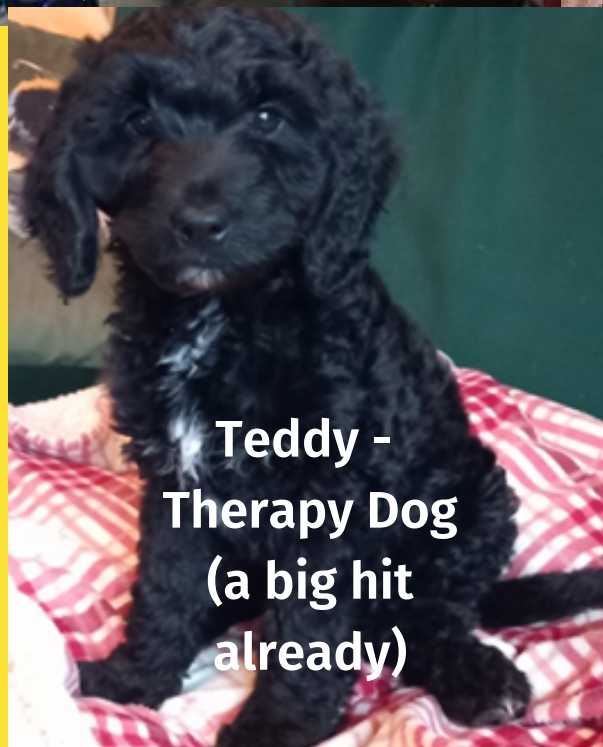
Teddy - Therapy Dog (a big hit already)