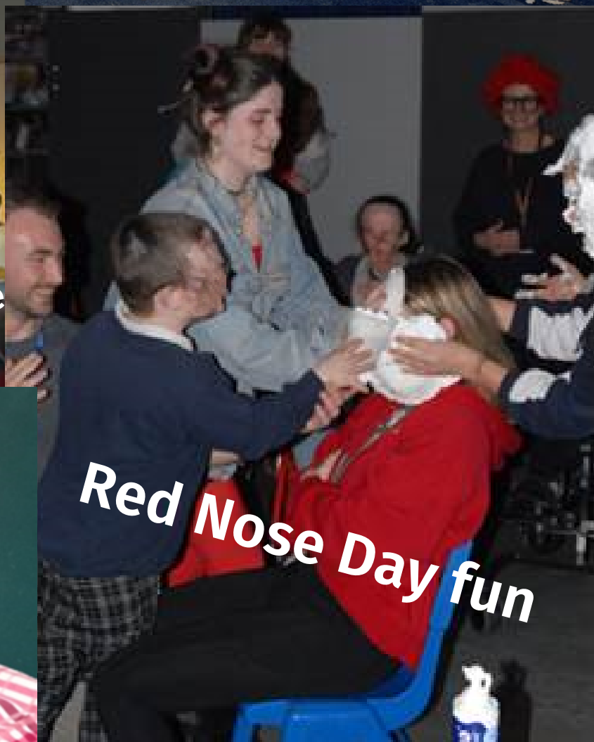
Red Nose Day fun