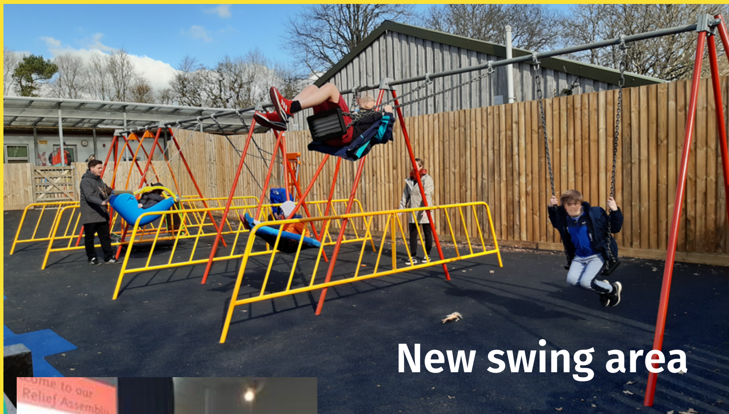
New swing area