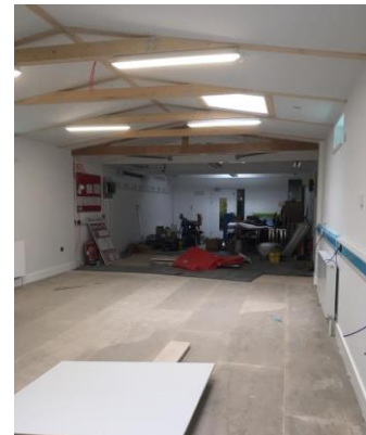
Second floor meeting room/training area

Bidwell Brook School Playground – As you can appreciate, the contractors have needed to disturb a substantial area of the playground, giving us the opportunity to update the outdoor play area. Phase One of the playground work will need to include surfacing and also installation of some play equipment which will likely include a multi-use swing, spinner, wheelchair roundabout and wheelchair trampoline. We have started our fundraising and are heading towards being able to fund the surfacing works but will need help in purchasing the play equipment. FOBBS, Friends of Bidwell Brook School, are currently collecting donations towards Phase One of the playground via GoFundMe https://gofund.me/61c91c14