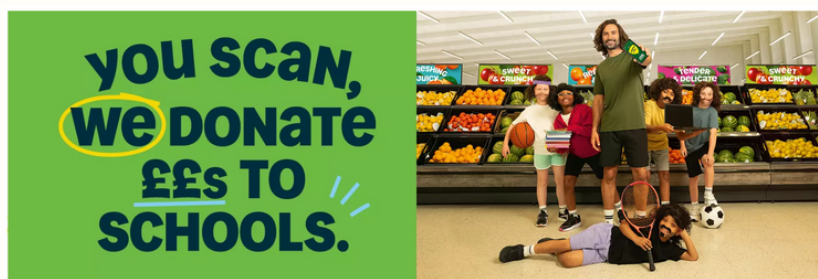
CASHPOT FOR SCHOOLS - ASDA GROCERIES

The Christmas raffle is one of our biggest fundraising opportunities of the year, so please don't forget to return your money and stubs to the School office asap to be in with a chance of winning. We are gathering a good selection of prizes but are in need of some (full!) wine bottles, luxury gifts and foods, plus some smaller items for our Tombola. If you could help or donate in any way, this would be great! Thank you.